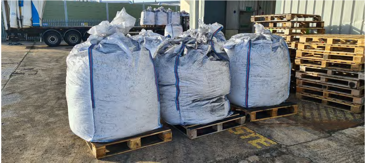
Bags of biochar awaiting loading 03/10/2022