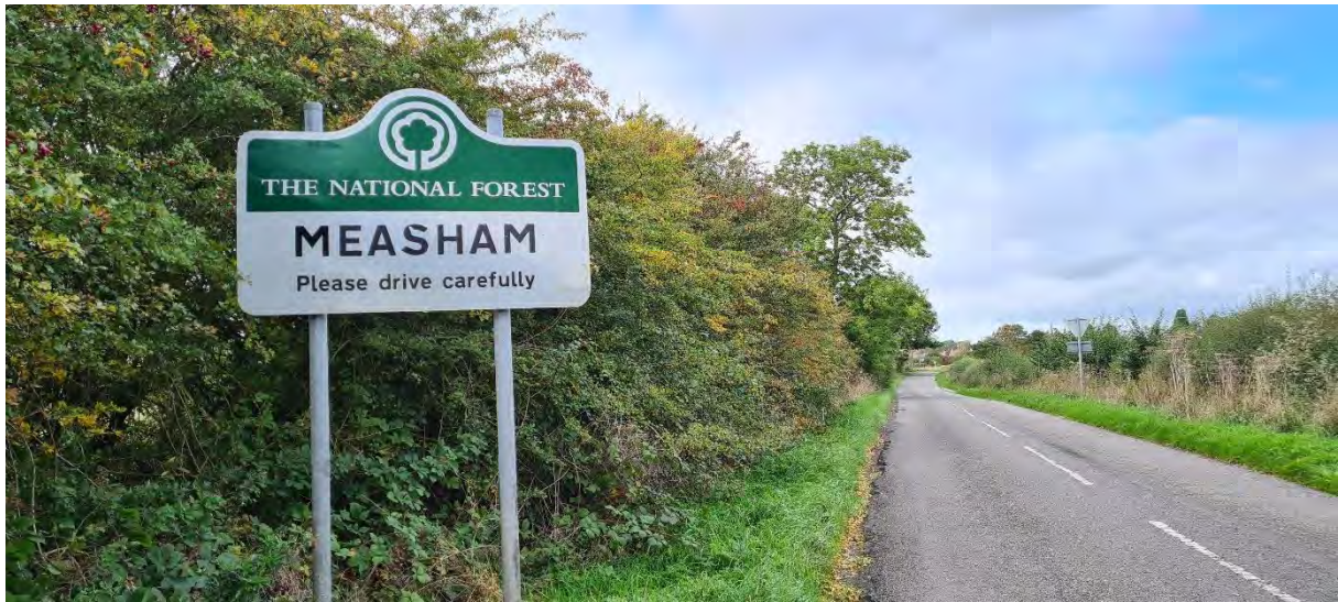
Signpost for National Forest on route to Minorca Woods site 03/10/2022