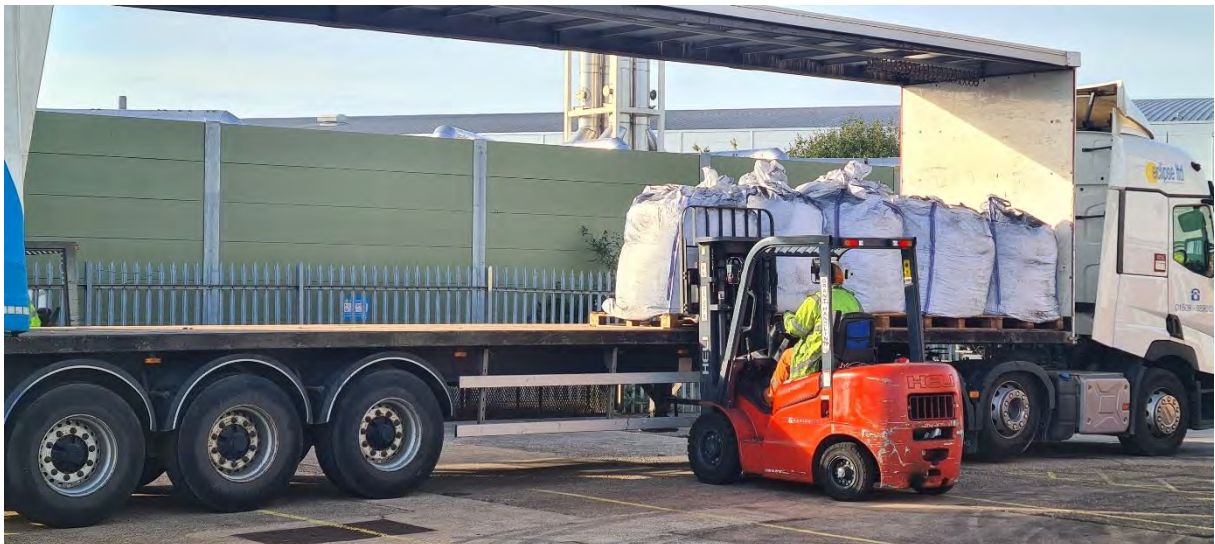
Bags of biochar being loaded onto transport vehicle 03/10/2022