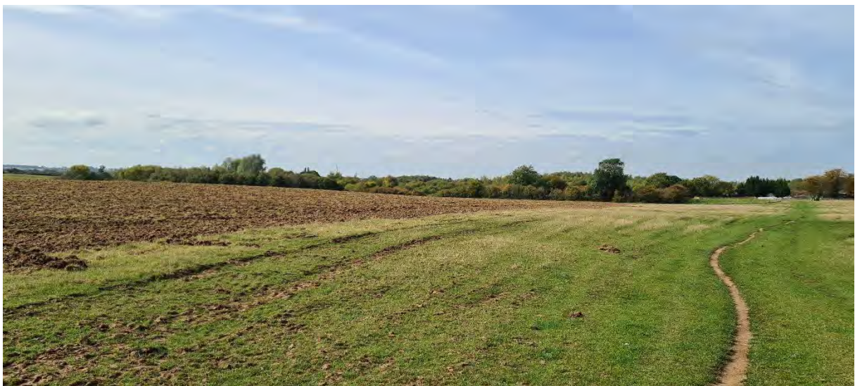
Section of this ploughed field will be used for trial – Site 1 03/10/2022