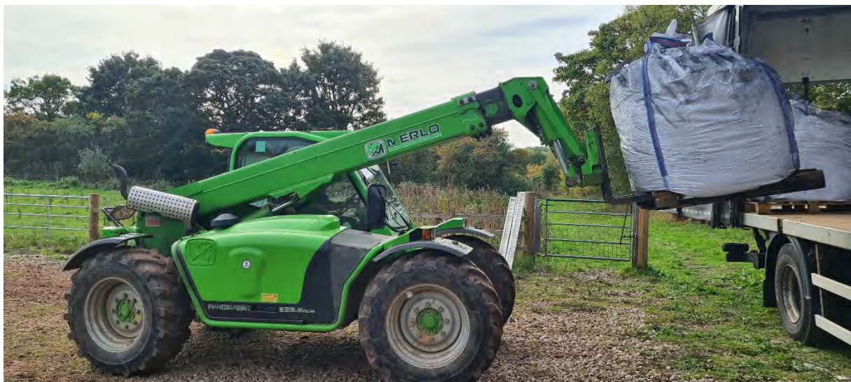
Bags of Biochar being unloaded 03/10/2022