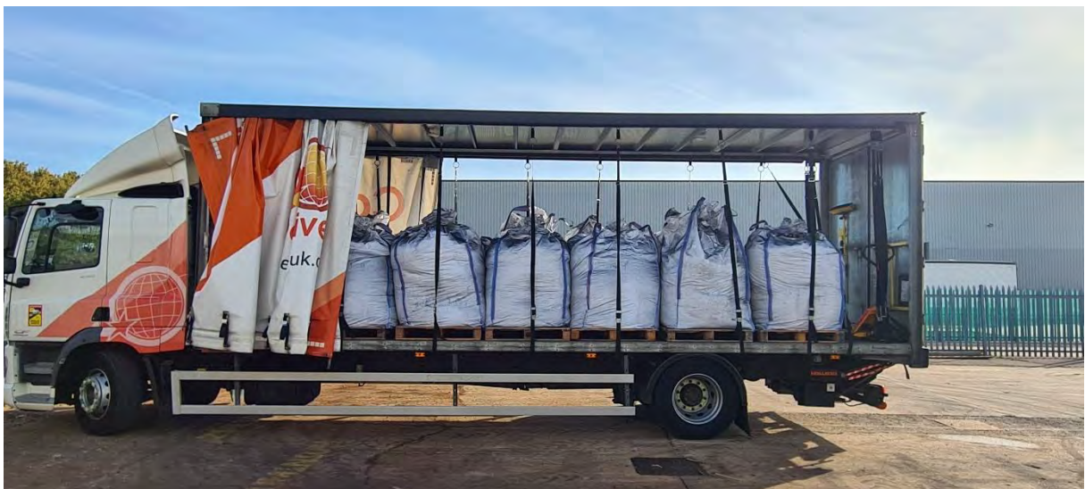
Bags of biochar loaded on a second vehicle 03/10/2022