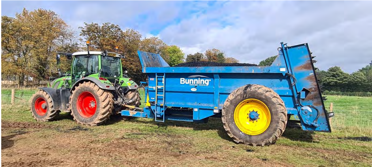
Biochar has been emptied from bags into spreading vehicle 06/10/2022