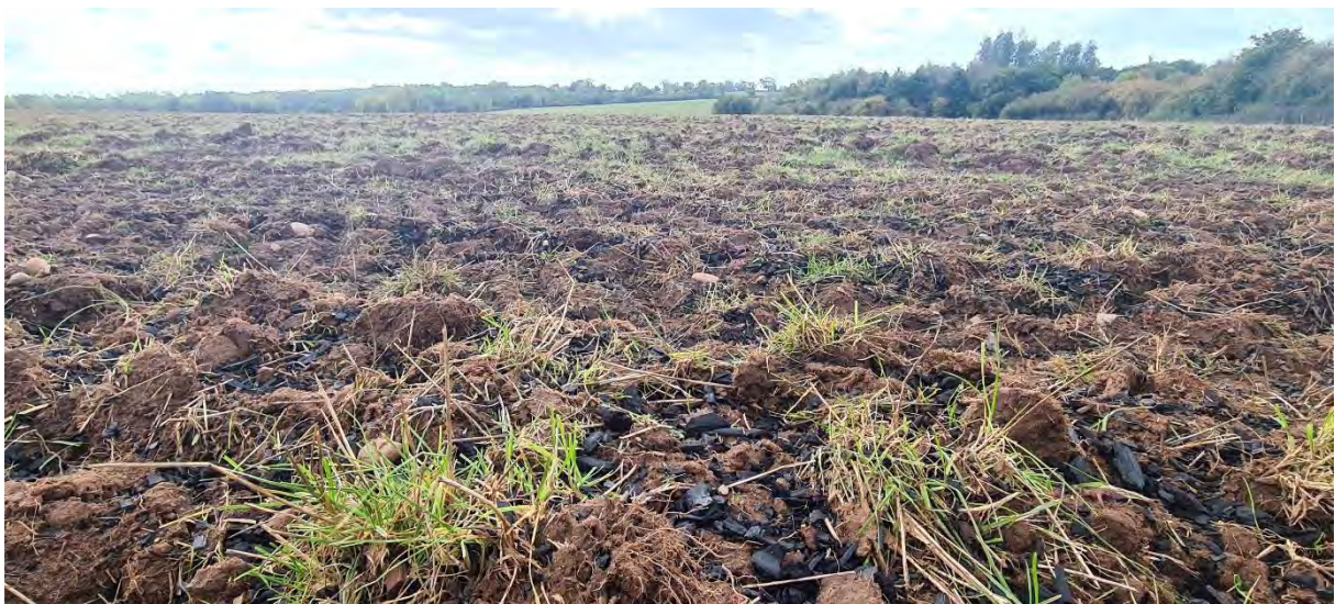
Biochar on the field - Site 1 06/10/2022