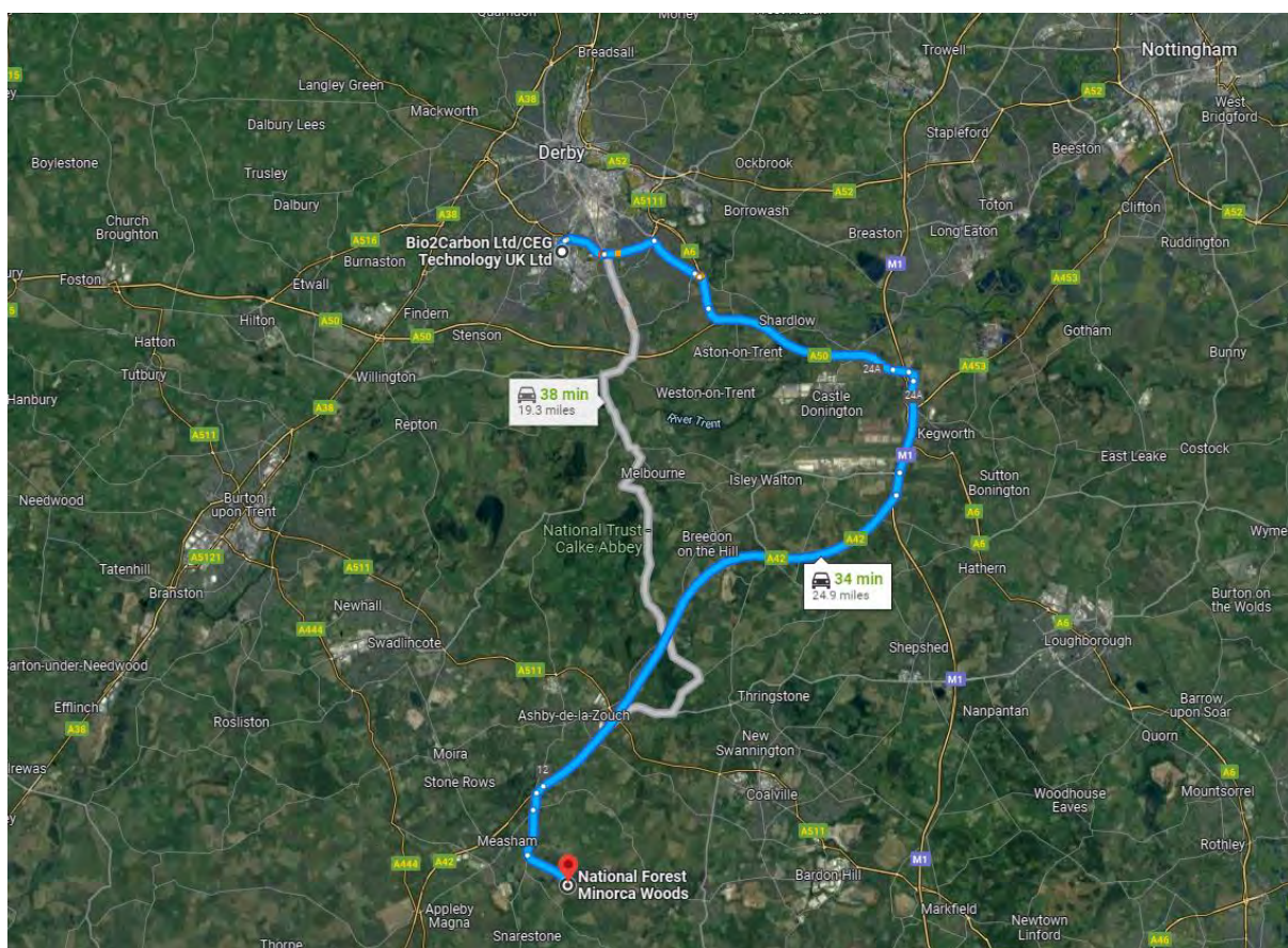
Location of the trial site in relation to Bio2Carbon