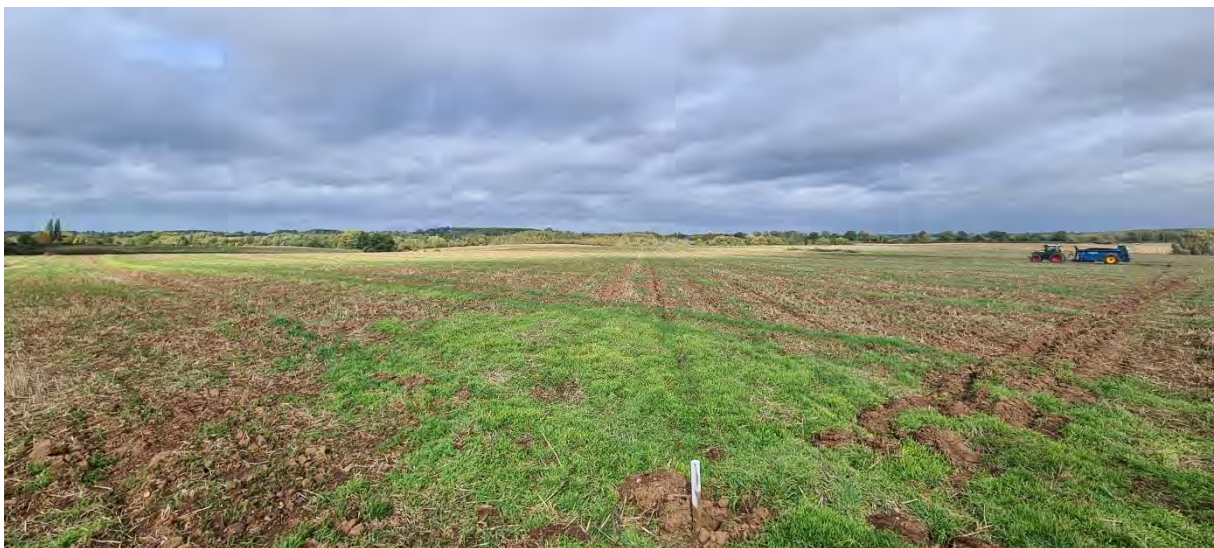
Section of this field will be used for trial – Site 2 06/10/2022