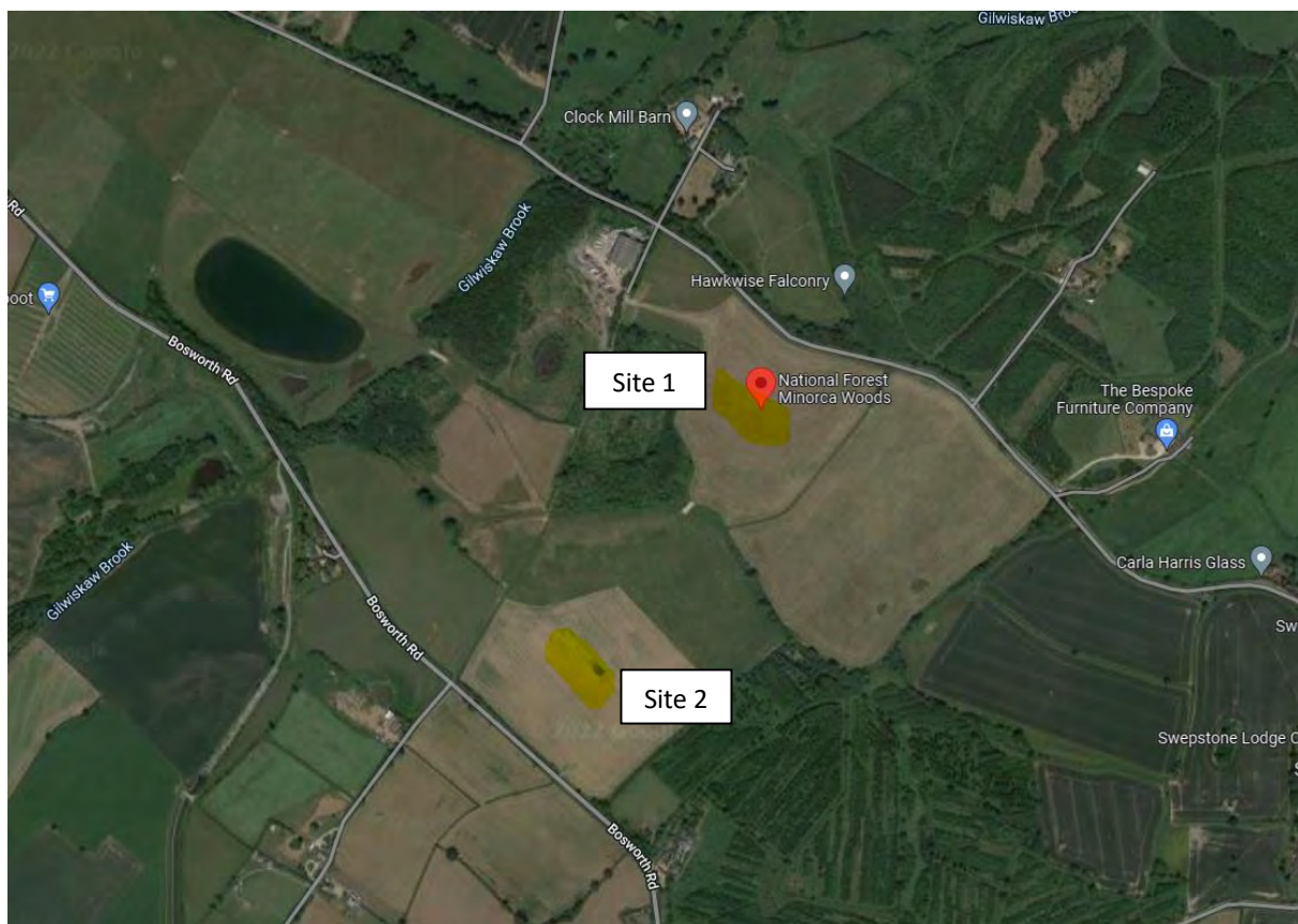
Approximate locations of the two trial sites highlighted in yellow