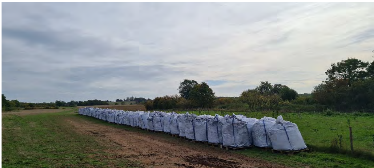
Unloaded bags of Biochar are stored awaiting spreading 03/10/2022