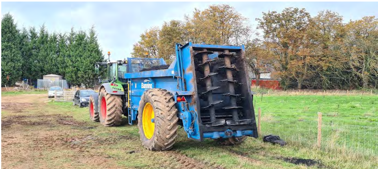
A walking floor in the trailer moves the Biochar toward the rotating spreaders 06/10/2022