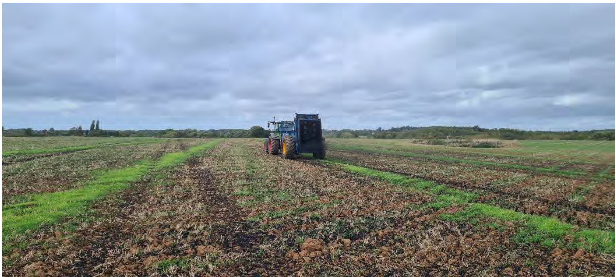
Spreader in action spreading Biochar at Site 2 06/10/2022